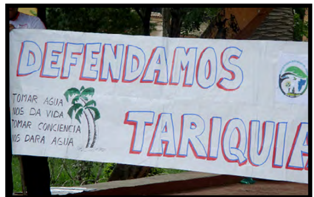
We defend the Natural Reserve. Drinking water gives us life, showing consciousness will give us water.