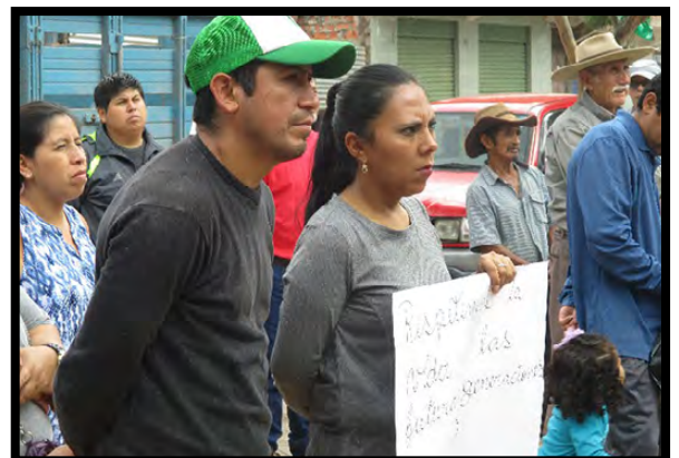
Rally in the main plaza of Entre Ríos to defend the Natural Reserve.