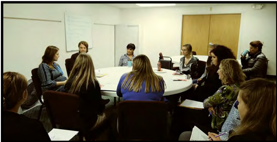
Also at the Immigration Resource Fair, Dubuque teachers of English Language Learners shared information on the past, present and future of ELL education and held a Q&A for future educators.

Last but not least, two of our students recently shared that the Presentation Lantern Center gives them strength and joy that helps carry them through the rest of their week. We feel the same way. Blessings to you and yours in this season of rejuvenation!